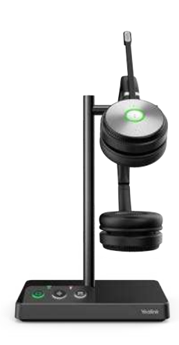
WH62 Dual Teams WH62 Dual UC

Based on hundreds of headform evaluations and thousands of wearing comfort tests, WH62 well meets the ergonomic requirements. Besides, with premier soft leather cushions and lightweight design, you can wear it all day comfortably. For more workspace freedom, WH62 can also free you up to 160m away from the desk.