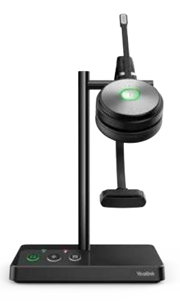
WH62 Mono Teams WH62 Mono UC