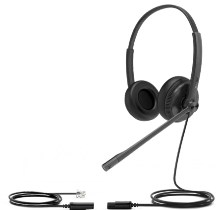
YHS34/YHS34 Lite Dual