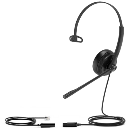
YHS34/YHS34 Lite Mono

Built for comfort with soft ear cushions and ultra-lightweight materials, the YHS34/YHS34 Lite is 10%~30% lighter than other headsets in the same range. Its ergonomic design makes this headset comfortable enough for long conference calls and all day use.