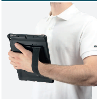
Portrait / Landscape layout