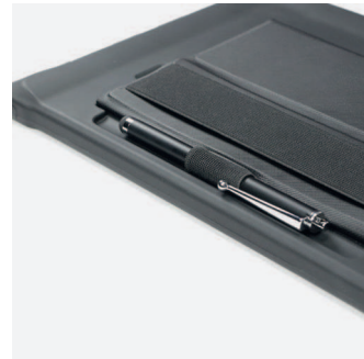
*Stylus not included