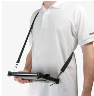
For typing in standing position

+ Shoulder strap attachment rings : Braided nylon, resistant to a 15kg traction per ring