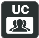
Compatible with mainstream UC platforms