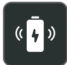
Up to 32 hours Talking Time