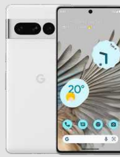
Google Pixel 7