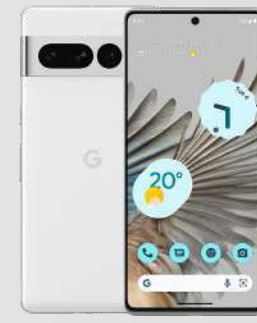
Google Pixel 7