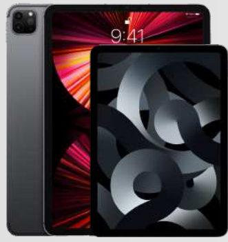
iPad Pro / Air Series