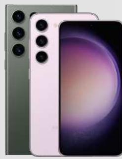
Galaxy S23 Ultra / S23+ / S23