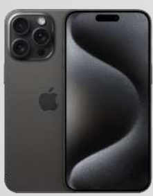
iPhone all Series