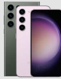
Galaxy S23 Ultra / S23+ / S23