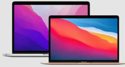
MacBook Pro / Air Series