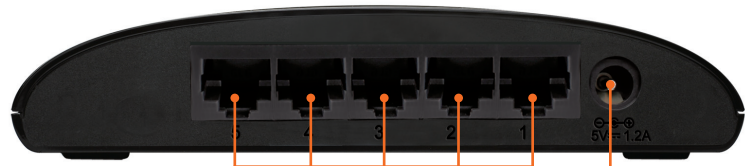
5 RJ-45 10/100 BASE-TX PORTS Connects to computers, print servers, or network storage