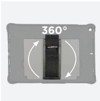
Rotating system 360°