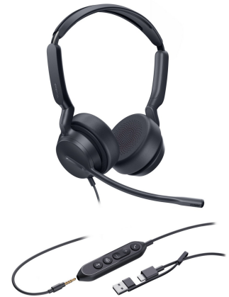
UH42 SE Dual