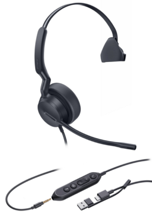
UH42 SE Mono