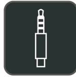
3.5 mm Jack