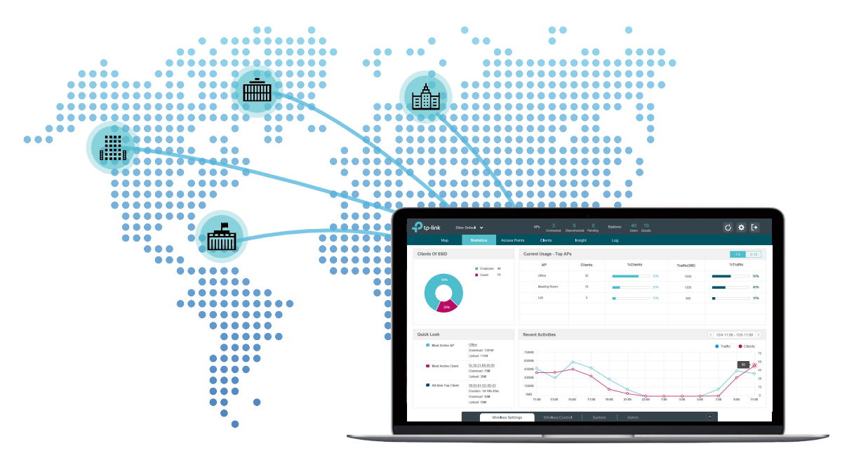
Omada Controller Software