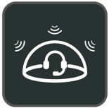
1-Mic & AI Noise Cancellation

The Yealink UH42, available in monaural and binaural, is a professional USB wired headset with crystal clear audio. The UH42 offers a lightweight, comfortable form, even for an entire workday. It's suitable for workers who spend a lot of time wearing headsets for voice communications.