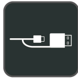
Flexible and Fast Plug-and-Play