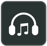
High-Quality Audio Experience