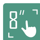
8-inch Multi-touch Screen