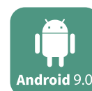
Android 9.0 OS