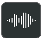
Optima Audio Experience