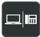
Multiple Devices Connection