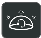
Acoustic Shield Technology

The Yealink WH62 is a new entry-level DECT wireless headset, with WH62 Dual and WH62 Mono two models. Work seamlessly with major UC platforms and integrate natively with Yealink IP phones. For crystal sound experience, Yealink Super Wideband Technology and Acoustic Shield Technology make you talk and hear clearly during phone calls and video conferencing. With easily on-ear control, interruption free, comfortable wearing, WH62 is a nice partner either for communicating or collaborating.