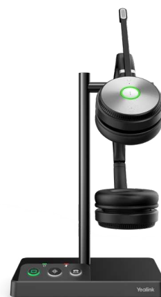
WH62 Dual Teams WH62 Dual UC

Based on hundreds of headform evaluations and thousands of wearing comfort tests, WH62 well meets the ergonomic requirements. Besides, with premier soft leather cushions and lightweight design, you can wear it all day comfortably. For more workspace freedom, WH62 can also free you up to 160m away from the desk.