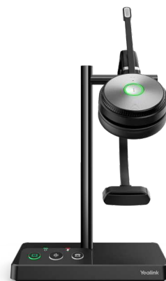
WH62 Mono Teams WH62 Mono UC