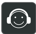
All Day Wearing Comfort